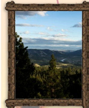
Photo Opportunities of Kamiah and the Upper Clearwater Valley Area